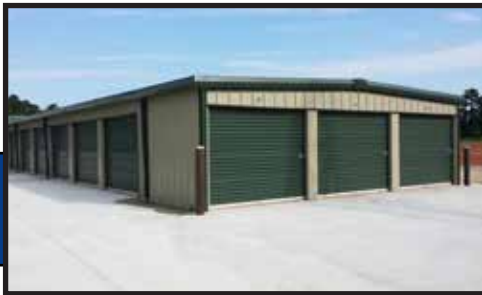
Prepainted Doors, Walls and Trim (25 Year Warranty)

Premier Building Systems has been building mini-storage facilities for over 20 years. Whatever you're looking for, we can help you design and construct a solution that is strong, secure and built to meet your investment goals.