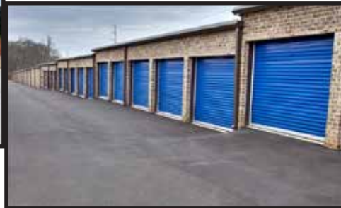
Climate Controlled Drive-up Units