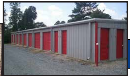
Standard 8x7 and 3x7 Doors (Custom Sizes Also Available)